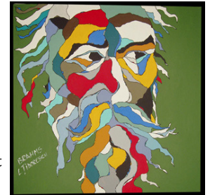
Artist rendition of Brahms

2. Brahms wrote music for piano, chamber ensembles, symphony orchestra, and for voice and chorus. When you write your first piece of music, what will it be for? A song to sing? Something for an orchestra or just one instrument—which one? What will you write about?